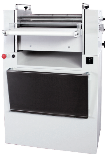
FORMATRICE ITP 500-600 E