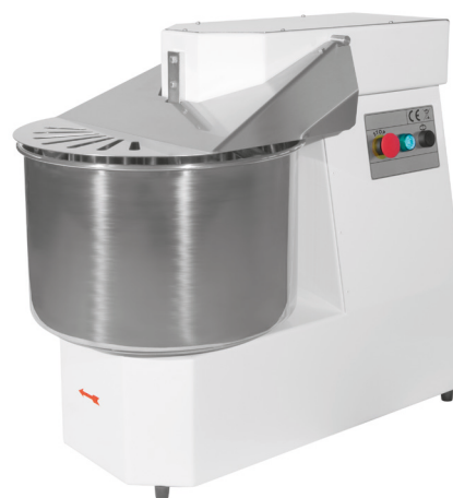
IMPASTATRICE ITP F