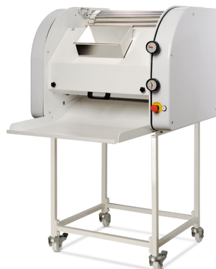
BAGUETTATRICE ITP 700